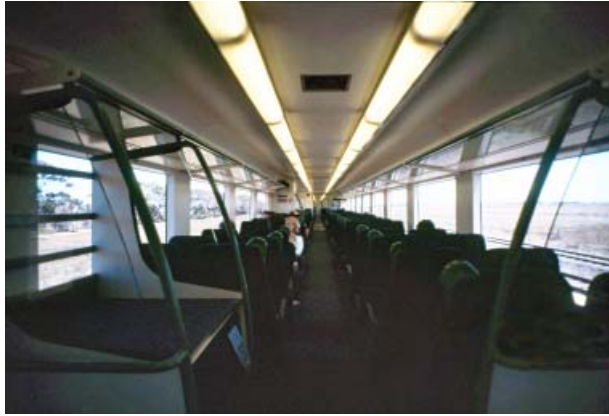
Taken in January V-Line to Geelong, 1963 Canon 7 19mm f3.5