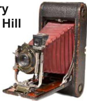
Table bookings and enquiries - www.apcsociety.com.au/market.html or email to market@apcsociety.com.au For information on all APCS activities visit www.apcsociety.com.au

Buy and sell anything to do with photography Cameras - Lenses - Books - Accessories - Images - Film Still - Stereo - Cine - Digital - Old - New - Collectable