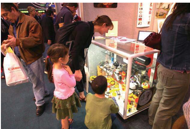
APCS Stand at PMA 2007