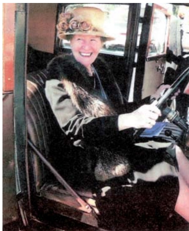
Old cars and old memories...