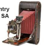
Table bookings and enquiries - https://www.trybooking.com/CKNVI or visit www.apcsociety.com.au/market.html or email to market@apcsociety.com.au For information on all APCS activities visit www.apcsociety.com.au NOTE: COVIDsafe - rules that apply on the day

Buy and sell anything to do with photography Cameras - Lenses - Books - Accessories - Images - Film Still - Stereo - Cine - Digital - Old - New - Collectable