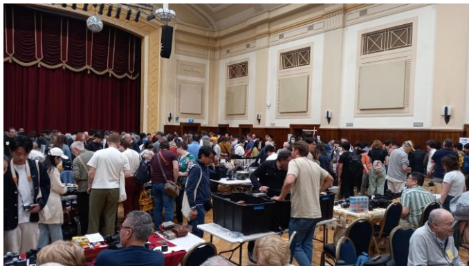
The main hall at the September Box Hill market

But running these markets does take effort and we would welcome some volunteers to assist make them even more successful. The dates for the Box Hill markets for 2024 are 17 th March and 15 th September. A date for an Adelaide market is yet to be determined.