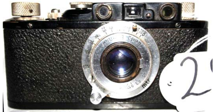
Leica II with Elmar 5cm f:3.5 Lens c.1932 - $480