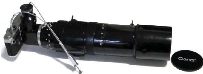
Canon P with Mirror Box 1 and 400mm f4.5 Type 2

At the AGM I brought along a Canon 400mm f4.5 that I recently acquired. Introduced in 1956 it used the Mirror Box 1 for use with the thread-mount Canon rangefinder models, thus any of the Leica thread-mount cameras. This particular lens is a Type 2, introduced in 1960 for use with the Canonflex range via an adapter as well as the Mirror Box on RF cameras. The Type 2 was in production for one year with less than 300 made.