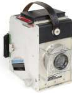
A French 1920's Gallus Stereo camera