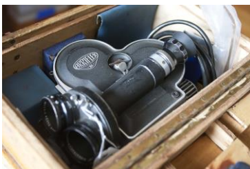
A 16mm Arriflex movie camera