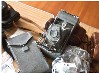
A Kodak folder..only this one was Grey with matching Grey case