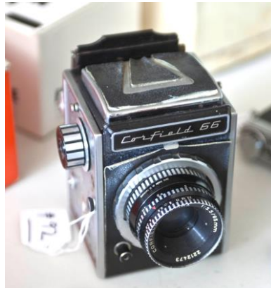
And a Corfield 66 – not pretty, but have you ever seen one before?